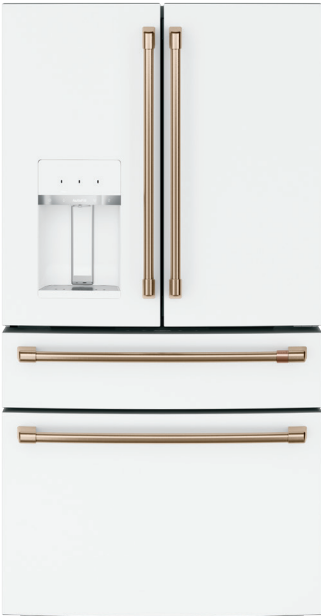
CXE22DP4PW2 Matte White with Brushed Bronze handles