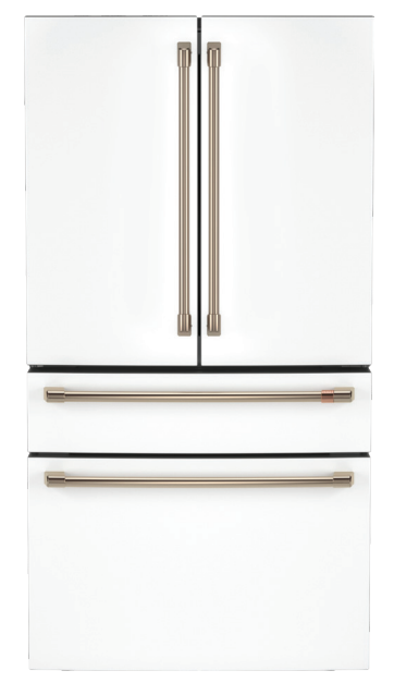
CGE29DP4TW2 Matte White with Brushed Bronze handles