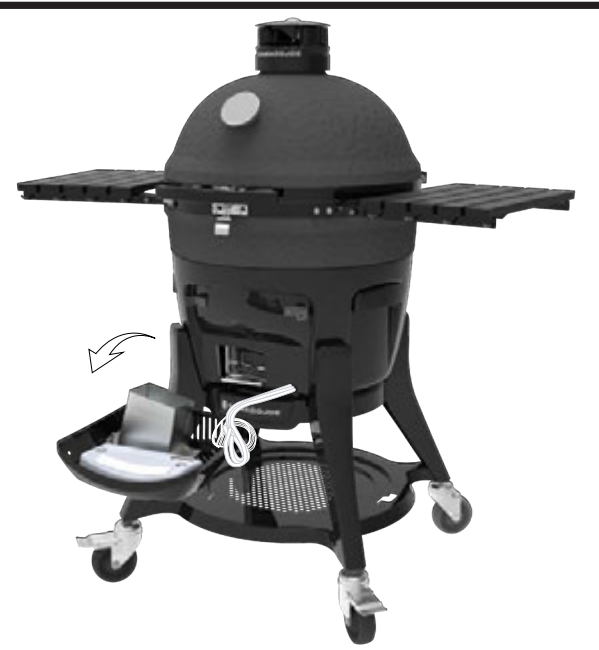
Remove front module.