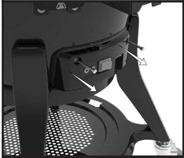
Loosen two screws from rear module. Please note, the screws do not have to be fully removed to disengage the rear module.