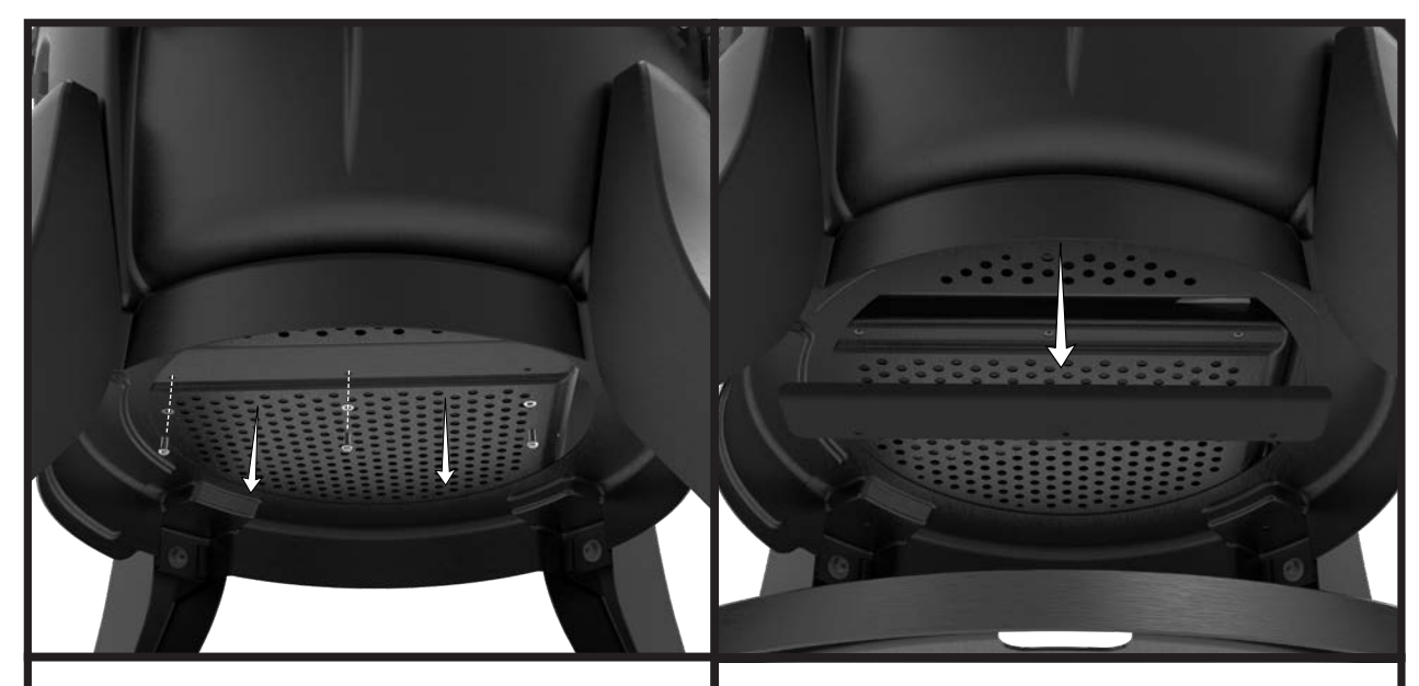
Remove the three wire harness cover screws.