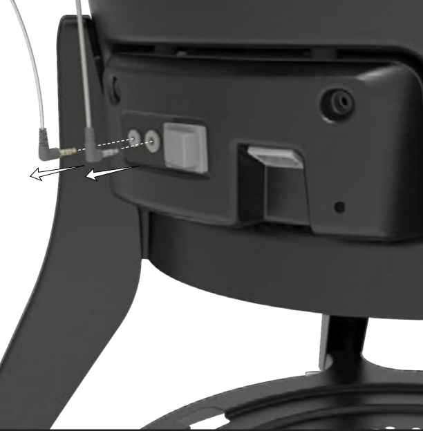
Unplug lid switch, pit probe, and power supply.