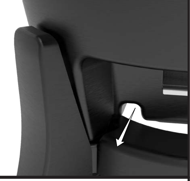
Fish the new wire harness through the rear pass through hole.