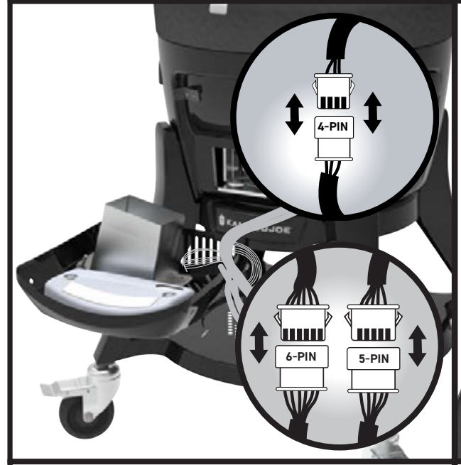
Disconnect the wire harness from the front module. Use caution do not apply tension on the wire harness.