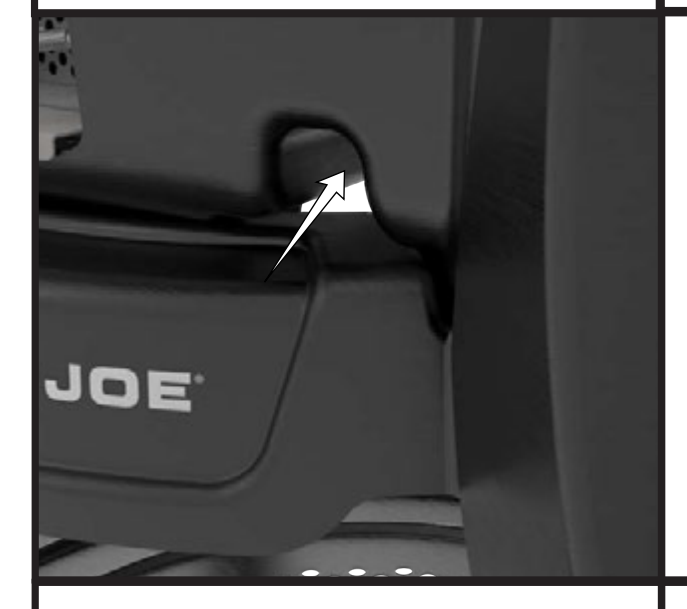
Fish the new wire harness through the front pass through hole.