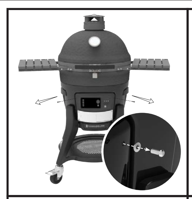
Remove two screws from front module.