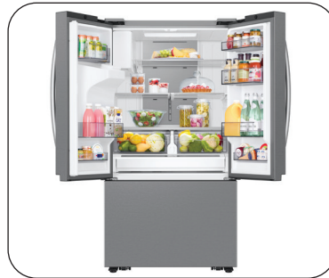
Large 26 cu. ft. Capacity