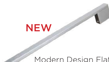
Modern Design Flat Handle Included