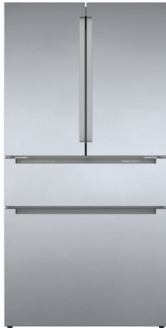
B36CL80ENS Stainless Steel w/ Recessed Handles

Innovative VitaFreshPro® technology helps keep food fresh up to 3x longer.* Enjoy less food waste, new innovative features and more thoughtful design.