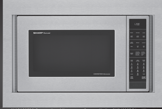
SMC1585BS Convection Microwave Oven with the RK94S30F Trim Kit

Includes Ducting, Finish Trim, and Easy-to-Follow Instructions