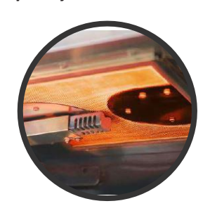
High Power InfraredBroiler