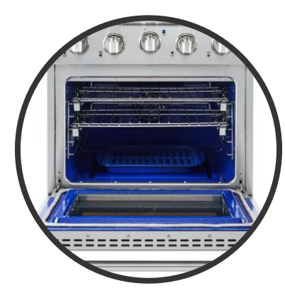
Large Capacity Oven with Blue Interior