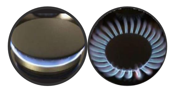
Ultra Low Simmer and High Power Dual Burners