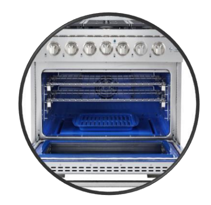
Large Capacity Oven with Blue Interior