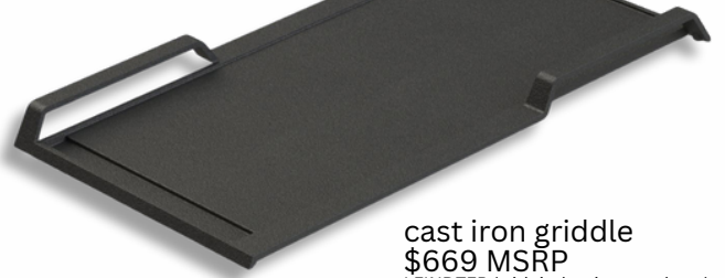
cast iron griddle $669 MSRP LFINDTEP (with induction purchase)