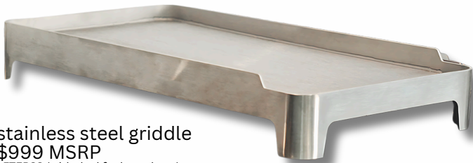
stainless steel griddle $999 MSRP LFTEPSS (with dual fuel purchase)